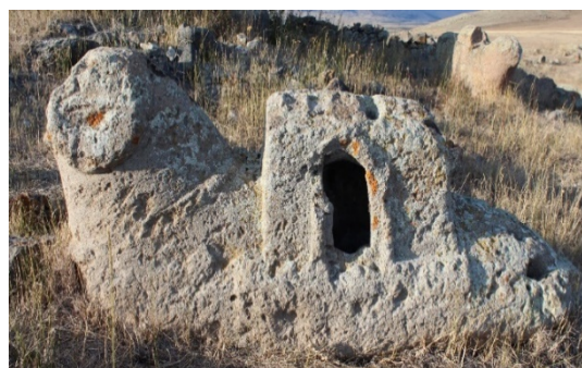
Fig. 4. Vardistsikhe, Sheep’s statue with a model of a church, gravestone.

In the artefacts of Samtskhe-Javakheti the sculptures of sheep and horses are more frequent, and they are also distinguished by their great age. There are also numerous large church models and obelisks (Fig. 4).