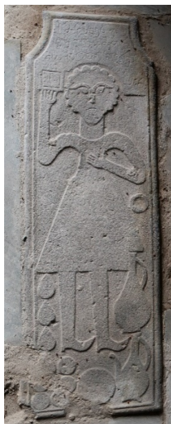
Fig. 2. Church in Goruli, Gravestone of Darejan of Kharchashani.

The life-sized figure of the bishop's grave can also be seen as a portrait of the builder of the family mausoleum-chapel. There are many portraits of both public figures and clergymen in contemporary monumental painting, as well as portrait-like images of saints (Monastery of the Holy Cross in Jerusalem, Bobnevi, Ananuri) [7: 96-111; 8: 156-170].