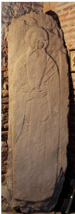
Fig. 1. The gravestone of Bishop Parthenoz.

Paul in Sagarejo, and the Deesis of the eastern facade of Svetitskhoveli) [6:304-407]. In the relief sculpture of the bishop, we can obviously discern the secular tendencies characteristic of the Orthodox art of the time, which indicate an orientation towards European works of art. As noted earlier, we know of no analogous tomb from Georgia's Medieval period.